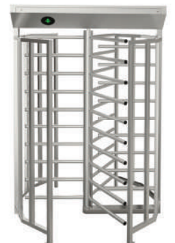
MAX Turnstile Gate System