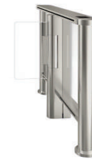
SWING Swing Gate System