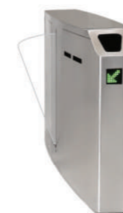
WING Flap Gate System