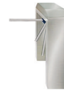
TRI Tripod Gate System